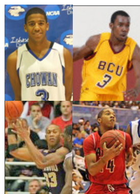
Chowan/B-CU/CAU/PV A&M Sports Photos