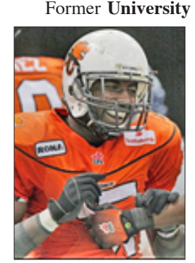
BC Lions Photo