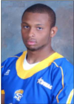
Southern Sports Photo