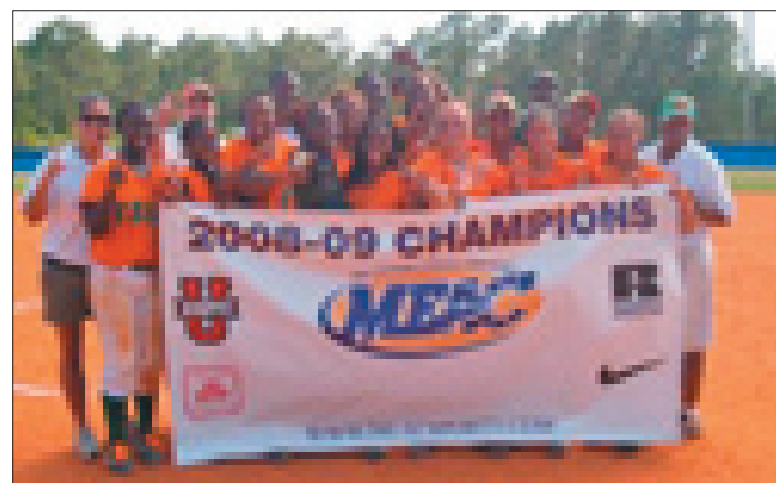
MEAC Sports Photo

The Mid-Eastern Athletic Conference (MEAC) will host the 2009 MEAC Baseball Championship beginning Thursday, May 14 through Sunday, May 17 at the Jackie Robinson Ballpark in Daytona Beach, Florida. The defending MEAC champion Bethune-Cookman Wildcats will enter tournament play as the number one seed.