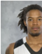
HAYLES: Second-half barrage propels ASU to SWAC title.