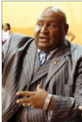
Claffin Sports Photo