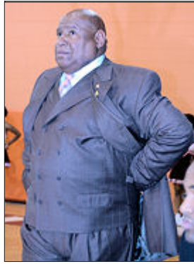
Onnidan Sports Photos