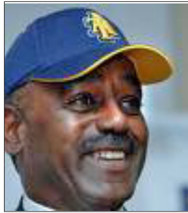
NC A&T Sports Photo