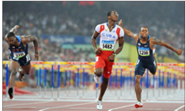
Beijing Olympics Photo

WHAT'S GOING ON IN AND AROUND BLACK COLLEGE SPORTS