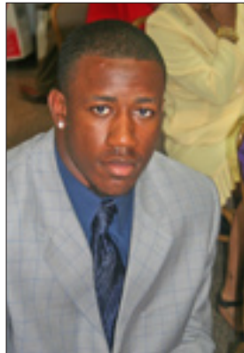
LITTLE BIG MAN: Virginia Union QB in the spotlight as 2008 season kicks off.

29 GAMES ON TAP FIRST FULL WEEKEND OF 2008 BLACK COLLEGE FOOTBALL