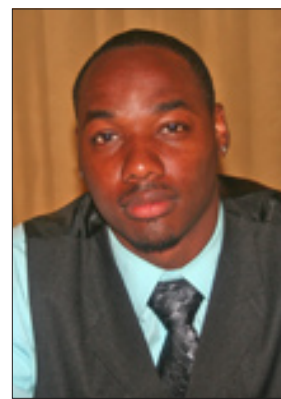
WINTON: Delaware State quarterback and team picked second despite winning '07 MEAC title.

PREDICTIONS IN, HYPE BEGINS; SIAC NO. 1 IN NCAA DIV. II ATTENDANCE, AGAIN