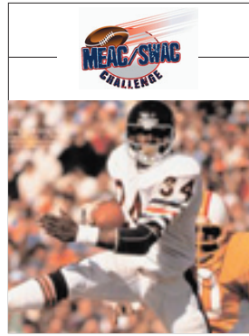
SWEET HONOR: Labor Day weekend game to honor legendary Jackson State running back, Walter Payton.