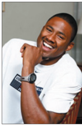
Oliver's Blog Photo