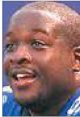
Hampton Sports Photo