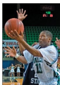
Pedraic Major Photo

CHRISTIAN: Point guard played all 40 minutes in title game.