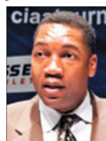
Shaw Sports Photo