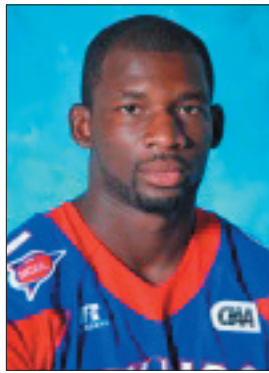
ECSU Sports Photos