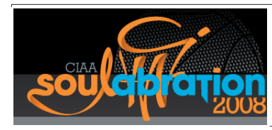
CIAA Tournament logo

The format for this year's 63rd annual CIAA Basketball Tournament has been revised slightly now that the league has ten teams.