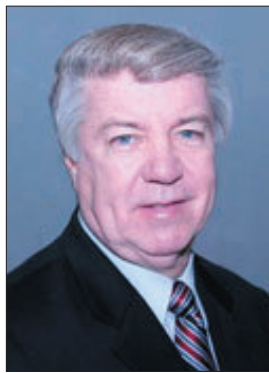
VUU Sports Photo